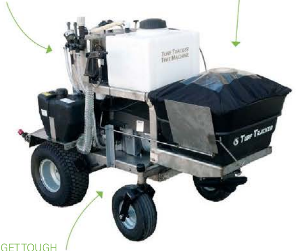
An all-stainless steel chassis provides durability.

LET'S MOVE It features zero-turn maneuverability and fits through 36-in. gates.