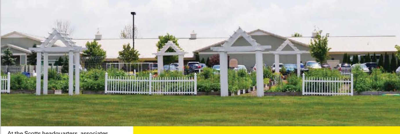
At the Scotts headquarters, associates maintain a community garden and donate the produce it generates to local food banks.

continued from page 18 together all service area managers— a few hundred people—annually for three days to train them in "best application practices" or BAP, which include application techniques, compliance and safety. They're responsible for taking the lessons back to their regions so every tech receives the same training.