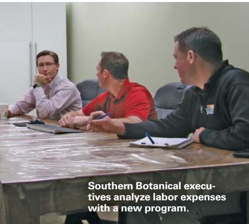
Southern Botanical executives analyze labor expenses with a new program.