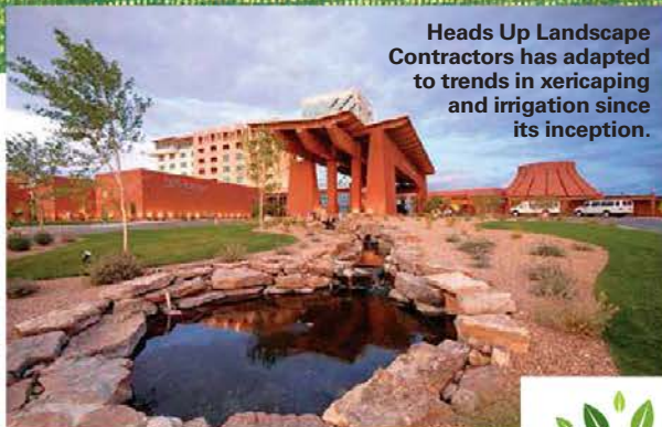
Heads Up Landscape Contractors has adapted to trends in xeriscaping and irrigation since its inception.