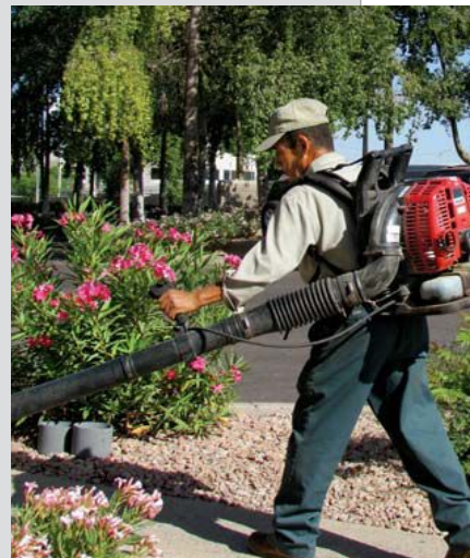
A focus on employee professionalism is a key component of ILM's growth.

serving clients. They're not expected to handle as many operational issues as they had in the past, such as staffing issues, Clinkenbeard says.