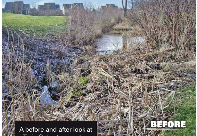
A before-and-after look at a Twin Oaks stormwater management project.

"The resources were already there, so the question was, how do we get the equipment we already have to do more work?"