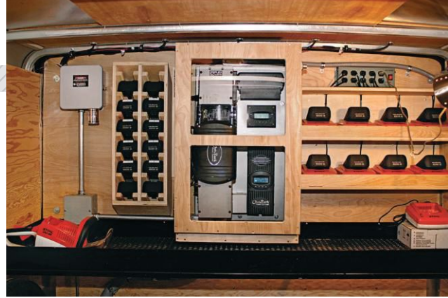
Seibert staff built a trailer to recharge handheld equipment batteries.

Katz is a freelance writer based in Cleveland.