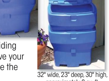
approximately 8 cu.ft.

Born from necessity, the DuraBox provides landscape contractors and municipalities with a cost effective, safe and secure salt or sand storage bin. Outdoorboxes.com offers a competitive edge to the market by providing our customers the opportunity to customize their DuraBox. Not only can you have your Company name and logo customized into the box, but also the option to choose the color of your boxes to harmonize with company colours.