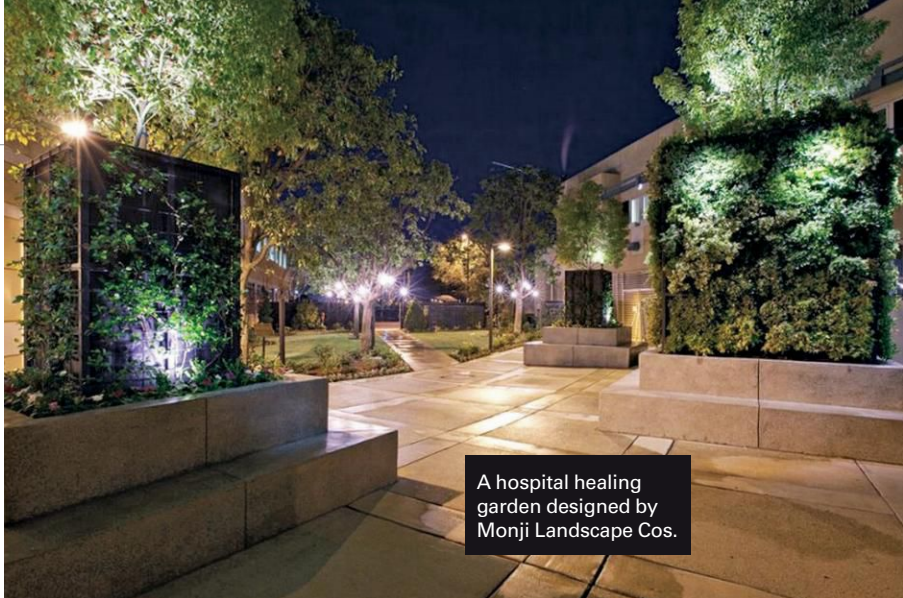
A hospital healing garden designed by Monji Landscape Cos.

Monji Landscape Cos. finds a niche in healing gardens.