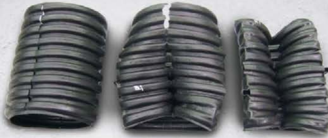
Standard pipe ASTM Crush Test Samples