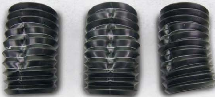
FLEX-Drain® ASTM Crush Test Samples