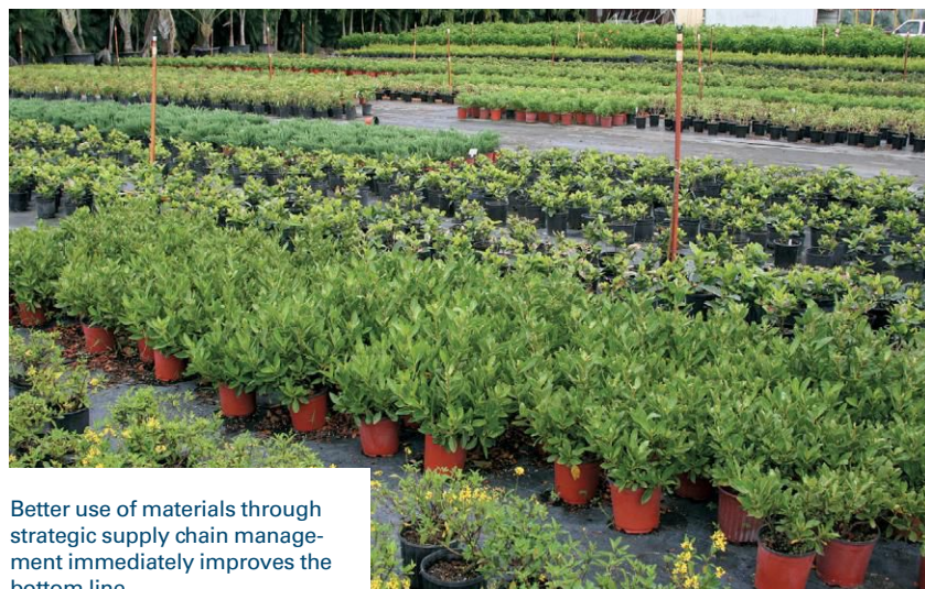
Better use of materials through strategic supply chain management immediately improves the bottom line.

Improve internal processes to identify material needs specified by your estimating and sales staff. Work with the production staff to understand how and when materials will get to the job site so production workers aren’t idle. Weekly meetings between the production scheduling staff and purchasing department are critical for accurate timing and sequencing of a large project. Timing is important so suppliers can understand well in advance when best to schedule timed deliveries. Courtesy goes a long way with suppliers. Ensure the production staff understands each piece of the project so work isn’t duplicated. Con-