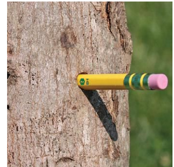
Clockwise from top left: It's the larval stage of ALB that kills trees; ALB larvae produce frass, and adult female beetles generate wood shavings; adult ALB emergence holes are large enough to easily insert a No. 2 pencil into; infestations lead to woodpecker damage.

are out of the reach of systemic insecticides that do not translocate effectively within the xylem. If a tree already has ALB larvae in the xylem, those larvae will successfully complete their development and new adults will emerge and disperse even if the tree is treated.