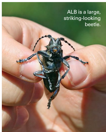
ALB is a large, striking-looking beetle.