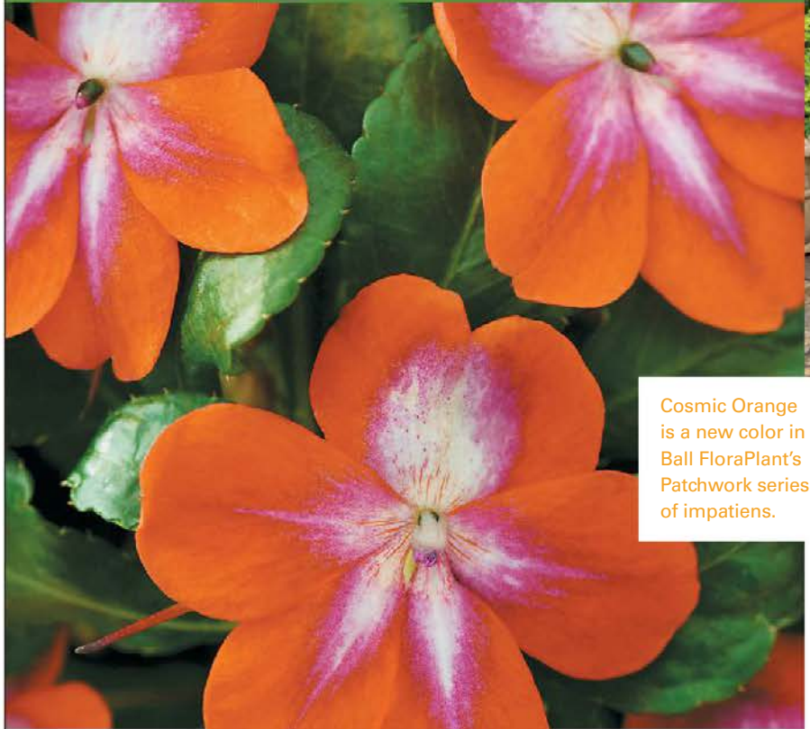
Cosmic Orange is a new color in Ball FloraPlant's Patchwork series of impatiens.

or pavers.” The plant, which can be walked on, has petite upright blooms that come up from its foliage.