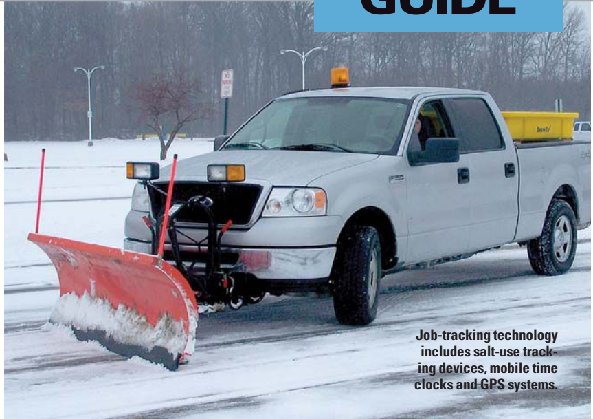
Job-tracking technology includes salt-use tracking devices, mobile time clocks and GPS systems.

ValleyCrest trucks are equipped with SnowEx's tracking devices, which document salt use and job times. In the past, employees wrote down the times they started and finished a job and how much salt they used. The method of manual recording can lead to human error if the truck operator forgets to