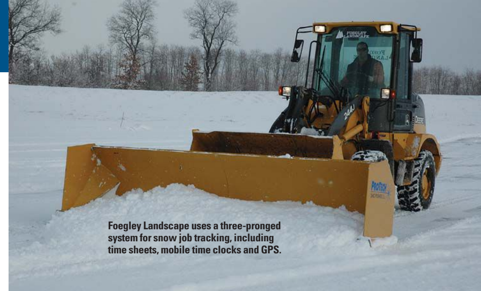
Foegley Landscape uses a three-pronged system for snow job tracking, including time sheets, mobile time clocks and GPS.

"If the crews are out working at night, by the time the administrative staff gets in the next morning, they can pull in the field notes from the previous night and answer any questions without having to track down the employee who