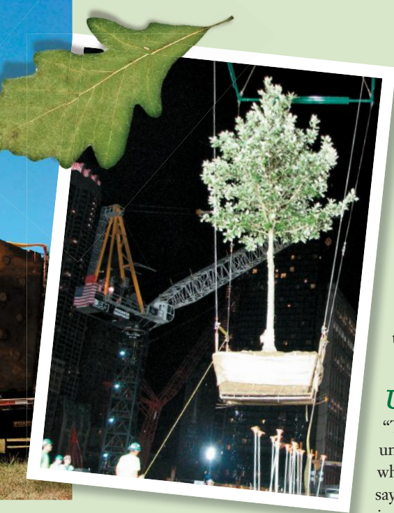
Environmental Design workers load two swamp white oak trees onto a flatbed truck at the New Jersey holding yard (left); The team lowers a tree down onto the 9/11 Memorial to be planted (above).

have to pull up all this stone work. They'd have to disconnect the irrigation system. And then they'd have to figure out some way to get a piece of equipment in here — because this tree weighs about 30,000 pounds — and pull this one out. And put a new one in. It would cost tens of thousands of dollars just to replace one tree.”