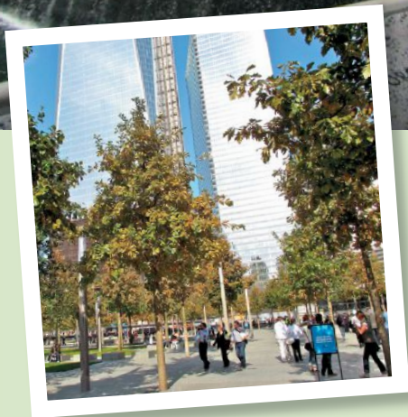
Swamp white oak trees rise between the 9/11 Memorial and the future entry of the 9/11 Museum (above); Visitors walk among the trees last fall (left).