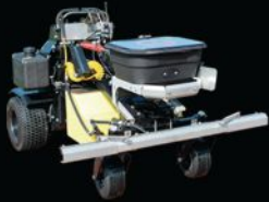
18 Gallon Spray System