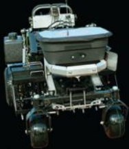
120 lb. Hydraulic Drive Spreader