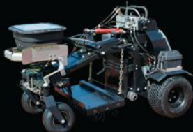
36" De-Thatch Rake