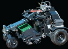
36" Slit Seeder