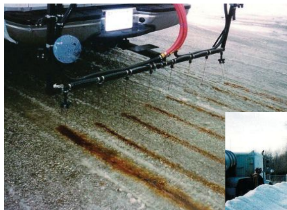
◀ A spray truck disperses a sugar beet-based deicer on the highway.