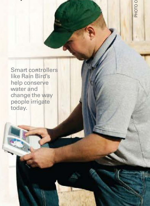
Smart controllers like Rain Bird's help conserve water and change the way people irrigate today.

Ultimately, water-saving irrigation technology must and will continue to advance, Shepersky says. Because "we don't get more water than the Earth already has."