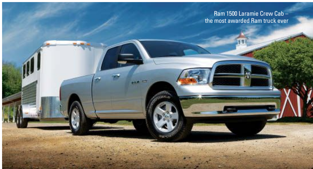
Ram 1500 Laramie Crew Cab – the most awarded Ram truck ever