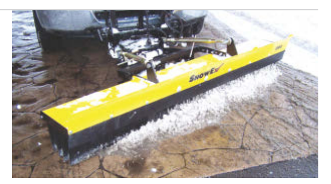
continued on page 46

Attachable to most brand-name snowplows, SnowEx's new SPB-072 and SPB-090 Snowbrooms are capable of clearing snow and slush without damaging concrete, sod or sprinkler heads. This makes them an ideal choice for use on decorative concrete, sidewalks and paths. They also add versatility to mid- and full-sized pickup trucks by allowing them to remove sand, salt and other debris after the winter season. Because the patented Snowbrooms take advantage of existing equipment, they contain no engines, pulleys, sprockets, belts, chains or any other moving parts. Trynexfactory.com