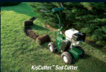
KisCutter™ Sod Cutter