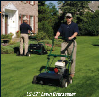
LS-22™ Lawn Overseeder

See Our Entire Lineup and Order Direct: 800-679-8201 or www.turfcodirect.com