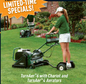
TurnAer™ 6 with Chariot and TurnAer™ 4 Aerators