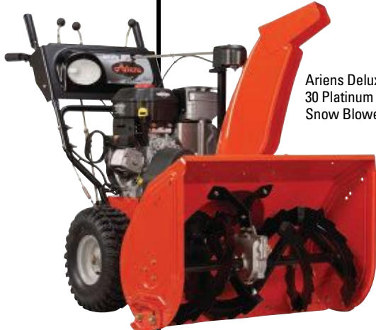
Ariens Deluxe 30 Platinum Snow Blower

Ariens Company has been building premium outdoor power equipment since 1933. The company provides professional snow removal products and the Gravelly brand of commercial mowing equipment. Gravelly commercial mowing equipment includes walk-behind, zero-turn and out-front mowers.