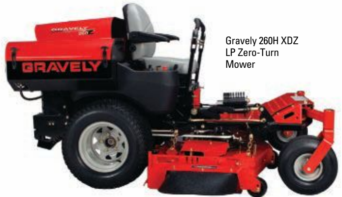
Gravelly 260H XDZ LP Zero-Turn Mower

Made of an all-steel construction, the Deluxe Platinum series features a heavy-duty aluminum XS GEAR CASE® and three-blade and 14-in. steel impeller. This series also offers reversible skid shoes, standard clean-out tools, 15-in. by 5-in. directional snow tread tires and automatic traction control. Available in two models, the Deluxe 24 Platinum and the Deluxe 30 Platinum, both machines have standard halogen headlights, hand warmers and automatic traction control.