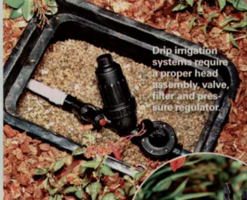
Drip irrigation systems require a proper head assembly, valve, filter and pressure regulator.

of poly tubing, close off the end of the line with a Figure 8-end closure or a compression end cap, leaving the end of the poly tubing so you can flush periodically to remove debris from the drippers, Raines says.