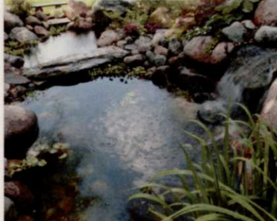
Above: You can follow the stream along its 10-ft. drop to the pond and landings. At right, hydrangas in full bloom compliment the other perennials, much of it installed by the owners.

For example, the central water feature originally was going to be just a