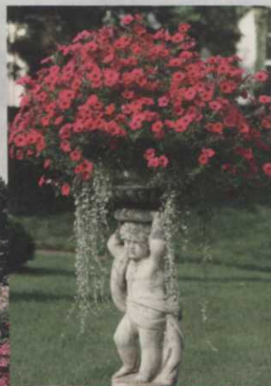
Tidal Wave Cherry Spreading Petunia ◉

Tidal Wave® has everything you love about other Ride the Wave® petunias: