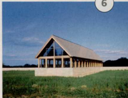
6 Oaklyn Branch Library, Evansville, IN 7 Target Retail Store, Chicago, IL.

Landscaping professionals are already taking advantage of the budding green roof phenomena. Growth media for green roofs is now a major business seg-