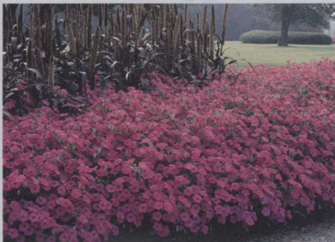
Tidal Wave Hot Pink Spreading Petunia ◉ & Purple Majesty Ornamental Millet ◉◉

Catch the Biggest Wave for Oceans of Color