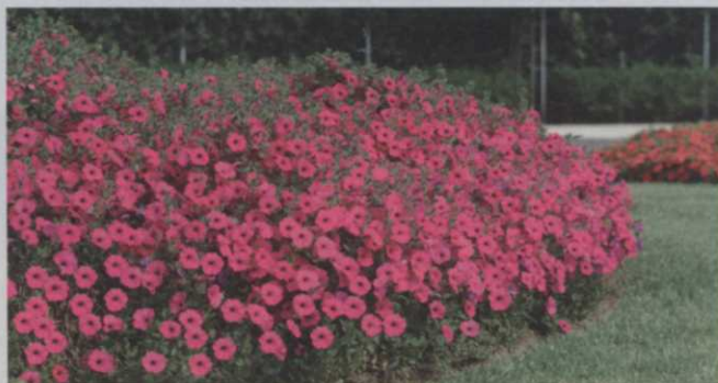
Tidal Wave Purple Spreading Petunia ◉