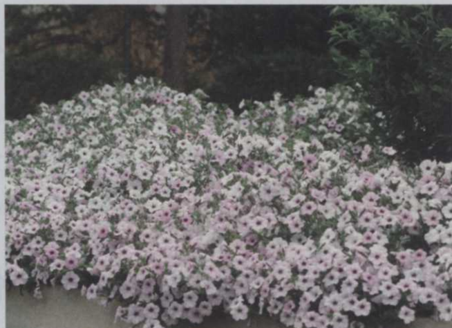
Tidal Wave Silver Spreading Petunia ◉