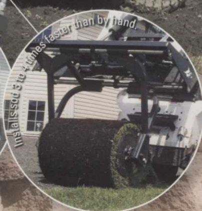
Installs sod 3 to 4 times faster than by hand.