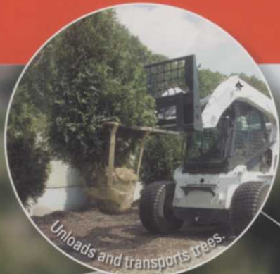
Unloads and transports trees.

If you do your job well, the trees and plants will look as if they've always been there. Your work will appear effortless—because Bobcat® machines and interchangeable attachments make hard work easy. And with Bobcat, that pretty much sums it up.