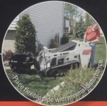
Place flexible pipe with minimal disturbance.