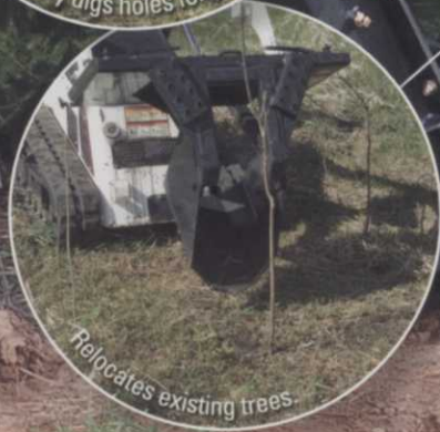
Relocates existing trees.