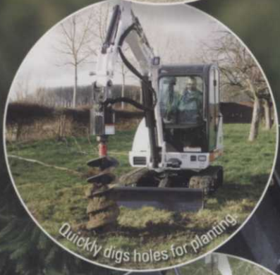
Quickly digs holes for planting.