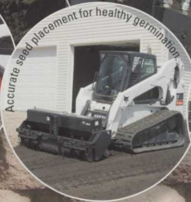
Accurate seed placement for healthy germination.