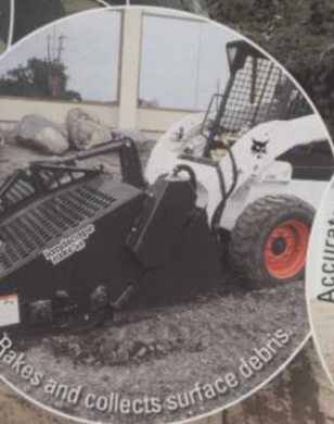
Rakes and collects surface debris.