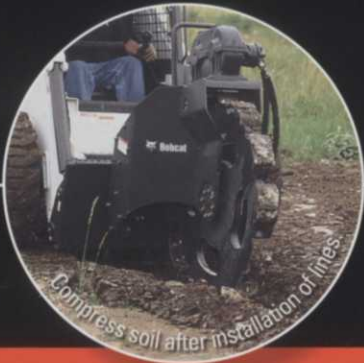
Compress soil after installation of lines.