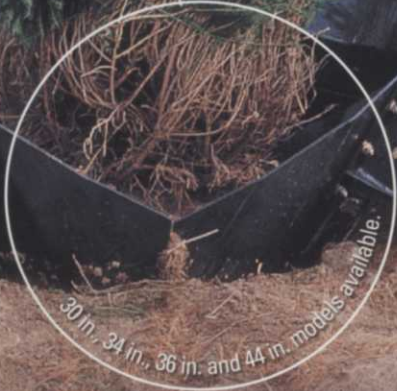
30 in., 34 in., 36 in. and 44 in. models available.