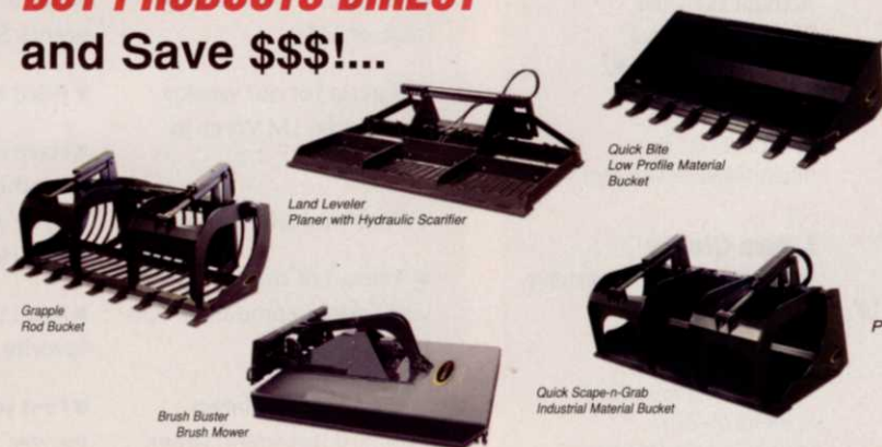
Grapple Rod Bucket