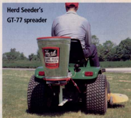
Herd Seeder's GT-77 spreader

HERD SEEDER 574/753-6311 LOGANSPOUT, IN www.herdseeder.com ■ GT-77 spreader mounts on compact tractors, ATVs ■ Spread seed, fertilizer, fire ant or slug bait ■ Stainless steel pivot plate centers spread pattern Circle #278