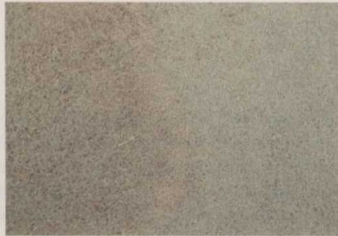
Brown patch (left and right) is significantly less likely to develop resistance in your landscape.