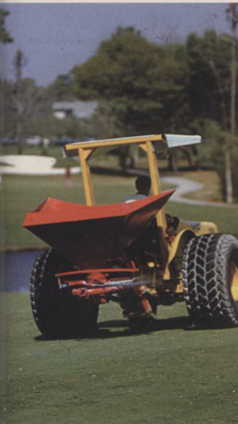
Mowed turfgrass requires a constant, steady supply of nitrogen during the growing season.

deeper, cooler layers of the soil profile. Only water-insoluble nitrogen (WIN) contributes to a soil reserve of N from which plants can draw as needed.