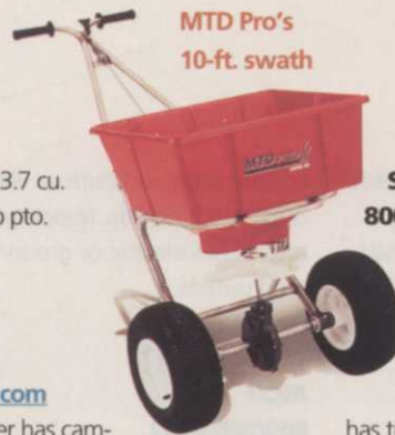
MTD Pro's 10-ft. swath