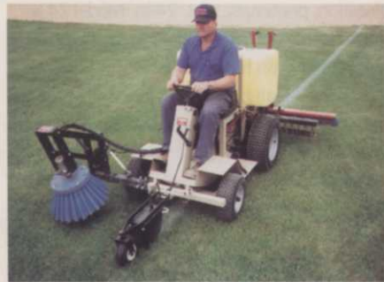
50-gallon Kromer unit can line fields, spray

AFMM with 50-gal. tank for lining paint or water on ballfields to dust control. Can be used with spray bar for chemical or fertilizer, with a boom for spraying 60-180 in. Spray gun, 25-ft. hose to reach areas normally hit by backpack units.