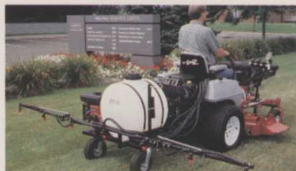
JRCO boom sprayer with ultra-low drift

30-gallon boom sprayer fits zero-turn mowers. Powered by 3.5 hp B&S engine with Udor di-