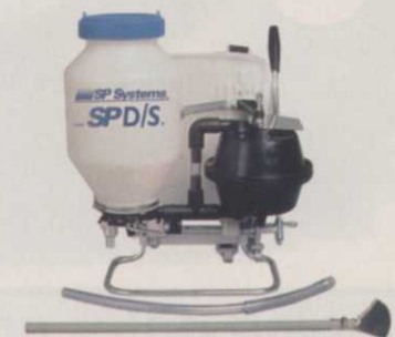
Models from 2-5.4 gal. spray capacity

SP Duster and Granular Spreader applies most