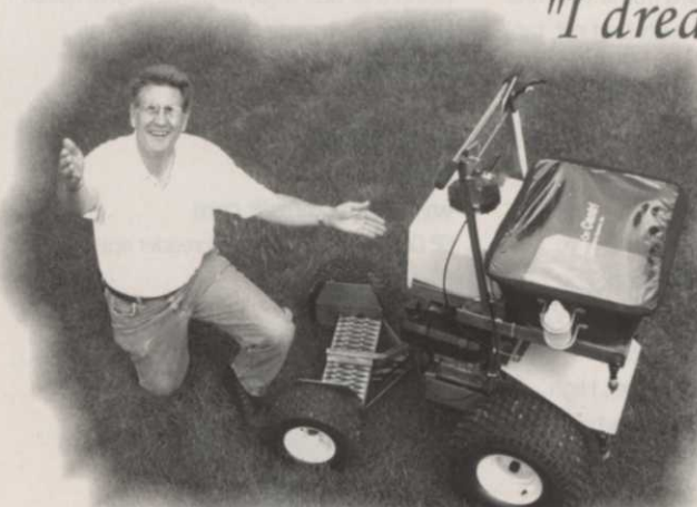
U.S. Patent# 6336600 B1

Perma-Green Supreme President and 27-year lawn care owner, 20-year sprayer manufacturer, owner of 3 patents, and fellow dreamer