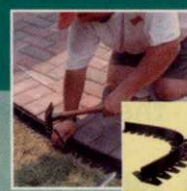
Diamond-Lok® Flexible "L-Shape"

Whether it's tough and durable landscape edging, easy-to-install paver/brick edging or colorful Venus® planters and trash receptacles, more landscape professionals choose Valley View brands than any other.