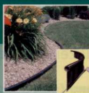
Ace of Diamonds® Landscape Edging