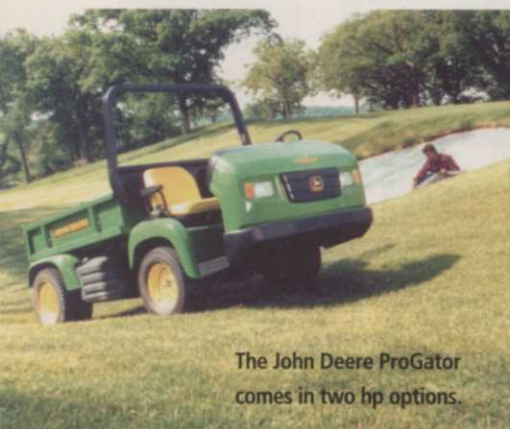
The John Deere ProGator comes in two hp options.