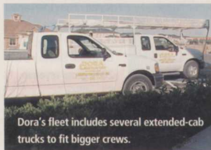
Dora’s fleet includes several extended-cab trucks to fit bigger crews.

Company profile: Dora Landscaping Company began in 1976 in Orlando, FL. “Each year we’ve prudently expanded, striving for excellence and providing only the highest quality service and workmanship at a reasonable cost. We operate four full-service divisions: landscape construction, irrigation, grounds maintenance and Southern Landscape Growers, our wholesale nursery. Landscape construction is our largest division. Highly qualified and trained superintendents manage each project. Our grounds maintenance division provides comprehensive grounds management services. Basic grounds management, integrated pest management (IPM), fertilization, arbor care and floriculture are all services we capably provide. The irrigation division provides build-to-suit and design/build irrigation systems to meet any customer’s needs. Our wholesale nursery