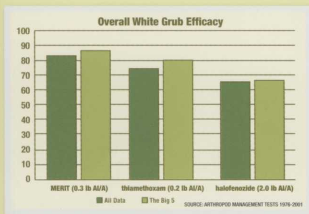
Figure 1: MERIT provides the best pre-damage control of the Big 5. The Big 5 includes the Japanese beetle, oriental beetle, european chafer, northern masked chafer and southern masked chafer.

MERIT is known industry-wide as the best option for preventing grub damage. Plus, MERIT effectively kills white grubs when they are already present, feeding on the roots of your turf. That means MERIT offers the best control of white grubs before signs of damage are visible, or pre-damage, from egg-lay to second instar.