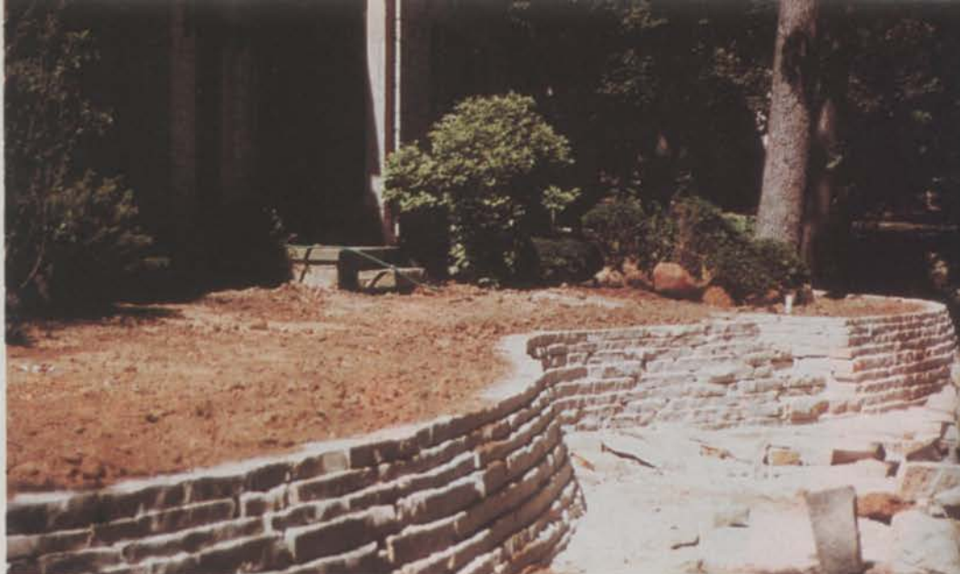
A landscape project will often get to the stage shown here, and a customer will decide it isn't anything like he or she originally wanted. In these cases, the "beer first, champagne later" approach would have been better.