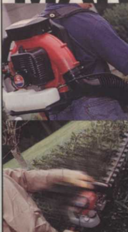
Maruyama. Commercial Tools.

From firefighting to landscaping, agricultural to industrial, in over 80 countries, we build tools rugged, reliable and powerful. The sort professionals count on to work as hard as they do . . . every day. True commercial tools.