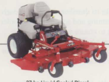
27-hp Liquid-Cooled Diesel