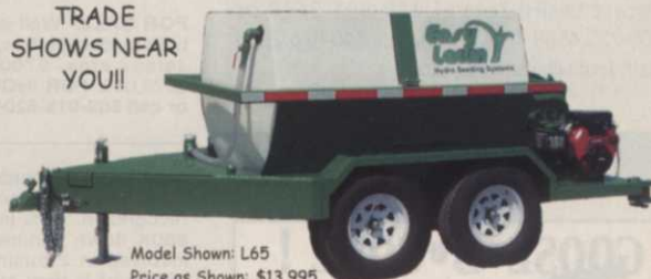
Model Shown: L65 Price as Shown: $13,995

FOR MORE INFORMATION OR TO SEE A DEMONSTRATION CALL 800-638-1769