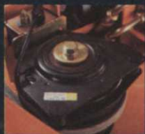
Scag 2-year electric clutch warranty.