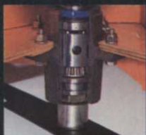
Scag 3-year spindle warranty.

For the Scag dealer nearest you, visit our web site at www.scag.com . Get the commercial mower that pays you back every time you use it . . . Scag.