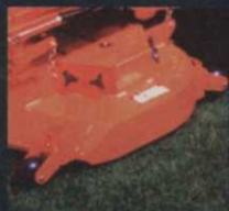
Scag 3-year deck warranty.

That's why Scag owners and operators are so loyal to our brand. They know Scag doesn't cut corners in the design and construction of our commercial mowers. And, they know we stand behind every Scag mower with the industry's strongest warranty and the best-trained dealer organization in America. And that means more money on their bottom line.