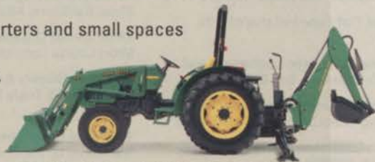
FAST IMPLEMENT ATTACHMENT AND DETACHMENT

They can haul more than their own weight, yet produce less ground pressure than the human foot.