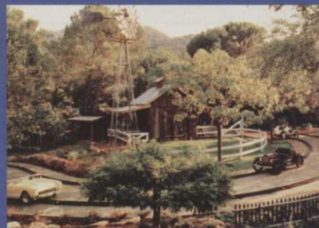
Visitors can check out other attractions like these go-karts at Bonfante Gardens.