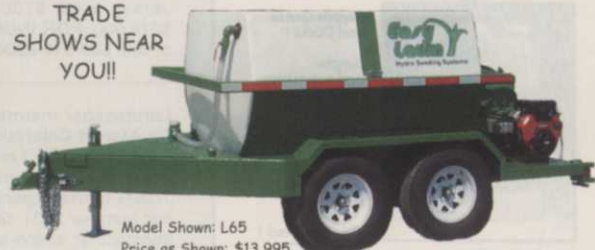
Model Shown: L65 Price as Shown: $13,995

VISIT US ON THE WEB FOR A LIST OF TRADE SHOWS NEAR YOU!!