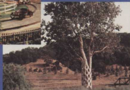
Pictured below is the famous basket tree seen in Ripley's Believe It Or Not.