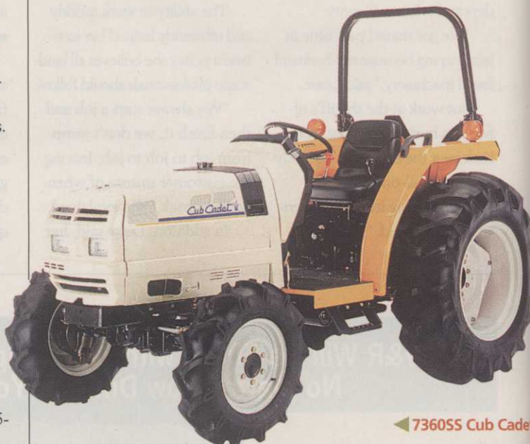
7360SS Cub Cadet

North America by Amatex, Milwaukee, WI, it is part of a full line of tractors in the 25- to 190-hp range. Also available in the Prince series are the 35-hp 435 and the 45-hp 445. All have 540/1000 rpm PTOs.