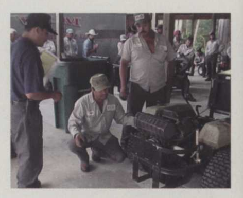
Hands-on demonstrations help employees learn the key points quickly.

ganization — your field supervisors and managers who have up-to-date information. In fact, involve everyone. All they want from you is a format and a small assignment so they can feel confident.