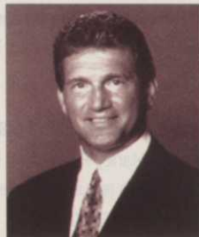
Keynote Speaker March 7th Joe Theismann

Tues., Mar. 7 • 9am-5:45pm USGA Seminar, General Session & Keynote Speaker Wed. & Thurs., Mar. 8 & 9 • 8am-11am • 2pm-4pm