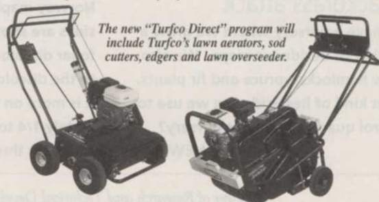
The new "Turfco Direct" program will include Turfco's lawn aerators, sod cutters, edgers and lawn overseeder.

The new "Turfco Direct" phone number is (800) 679-8201. Fax requests and orders can be sent to (612) 785-0556, mailed to Turfco Manufacturing, Inc., 1655 101st Ave. N.E., Minneapolis, MN 55449-4420 or e-mailed to sales@turfco.com . For fast, immediate savings, visit the company's website at www.turfco.com .