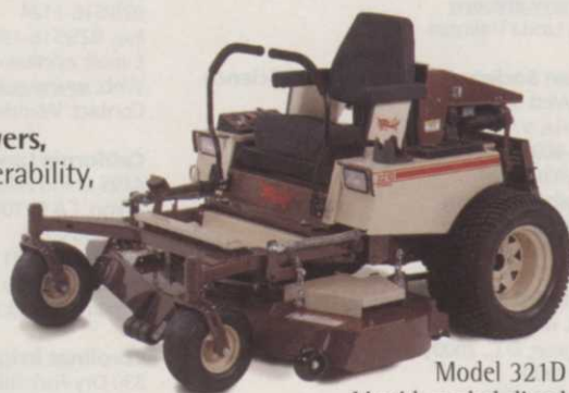
Model 321D Liquid-cooled diesel

M1 Series Mid-mount mowers, with true zero-turn maneuverability, include both air-cooled and liquid-cooled diesel models, 52" to 72" cutting widths.