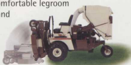
DuraMax™ 90° FlipUp™ Deck (44" to 61"). Bag, mulch or discharge using the same (44" to 72") deck.