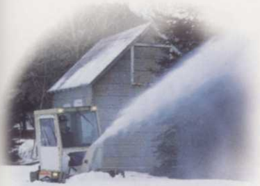
Snow removal & turf renovation systems, PTO-driven, for no-slip RPM.

It's easy to finance or lease a Grasshopper! Ask for details.