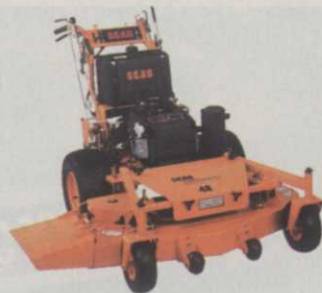
Scag Power Equipment

New from Scag, Mayville, WI, is the Ultimate hydro walk-behind, with a floating cutter deck