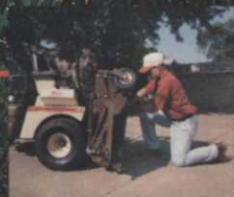
SL96 FlipUp™ Deck

SL96 FlipUp™ Decks rotate 90 degrees for easier access to the underside of the deck for simplified maintenance, storage and transport.