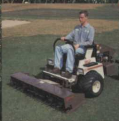
Grasshopper Model 928D

Remote Vac™ developed to clean leaves and debris from hard-to-reach places like hedges and flower beds.