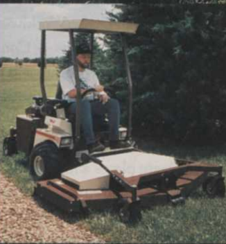
Grasshopper Model 928D

Combo Deck™ is introduced. Unique design allows easy conversion from mulching to side discharge to vacuum collection.