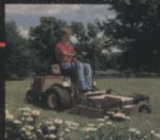
Grasshopper Model 618

AERA-vator™ debuts for aerating established turf without leaving cores, producing a softer surface on sports fields. Patented design penetrates harder soils without irrigation.