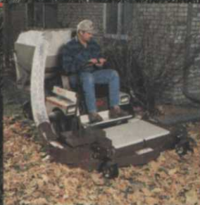
Quik-D-Tatch Vac® Collection System

Grasshopper introduces dual-hydrostatic drive to its line and originates swing-away dual control levers.