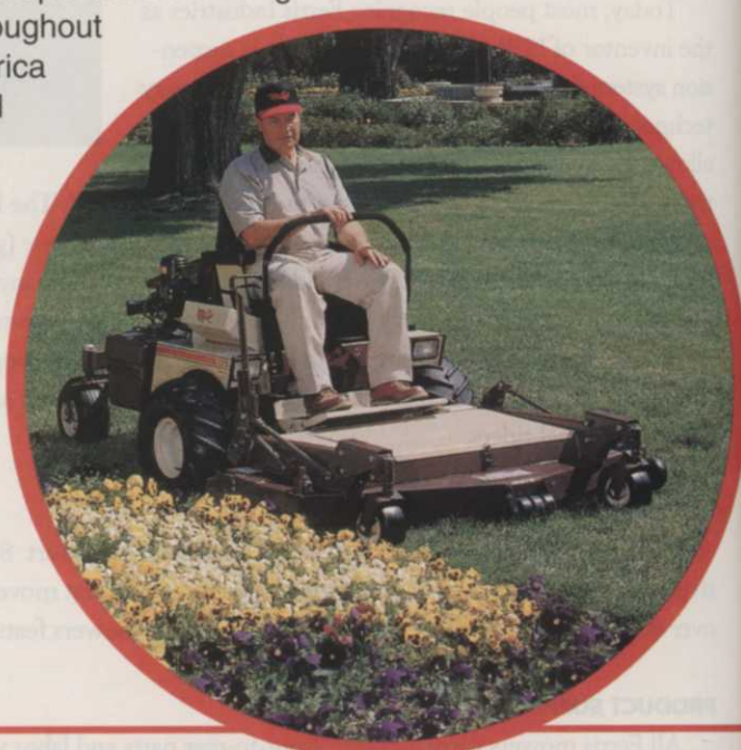
Grasshopper offers the industry's broadest line of zero-radius outfronts with 12 models, 14- to 28-hp, gas or diesel, air-cooled or liquid-cooled, plus year-round attachments and accessories.