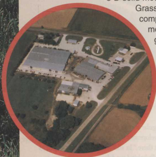
The Grasshopper Company's headquarters — including more than 200,000 square feet of manufacturing, testing and warehouse space — is located in Moundridge, Kan.

Grasshopper products are engineered using high-quality components and heavy-duty construction to ensure that every mower is built to last. A full line of zero-radius mowers and grounds maintenance systems are retailed by an extensive network of independent servicing dealers throughout North America and around the world.