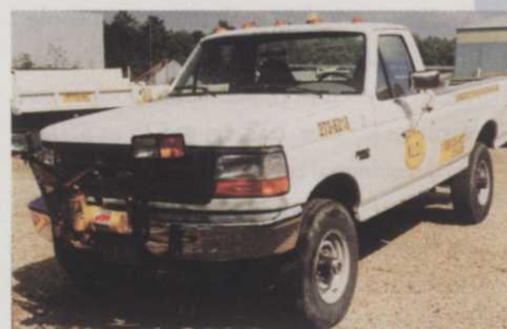
Nair's fleet includes dump body trucks and 3/4-ton pickups.

battery in a short time when used in combination with heater blowers, lights, radios and salt/sand spreaders.