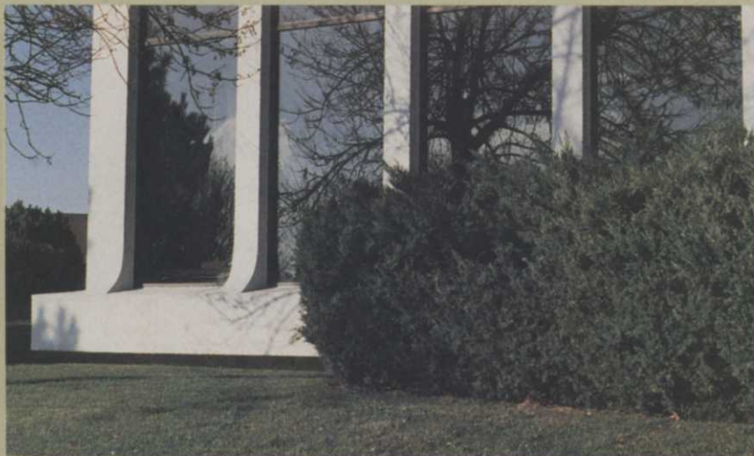
The sheared junipers give this property a dated look, as well as hide the graceful architectural elements at the base of this building.