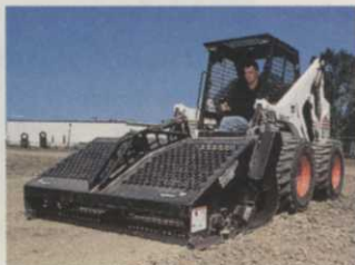
Landscape Rake grades, levels and picks up debris.