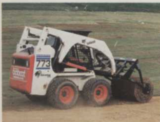
Sod Layer does the job quickly, effortlessly.