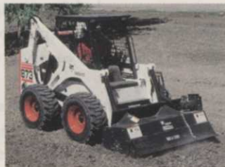
Tillage breaks up clumps, mixes material into soil.