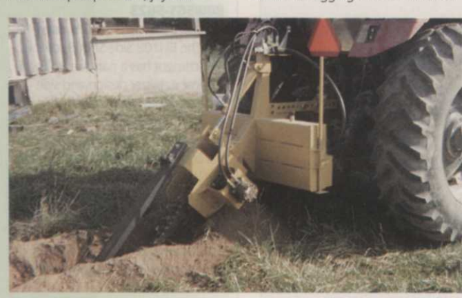
Glenncorp's GCI-500 3-Point Hitch Trencher can dig three feet.

The Bobcat 607 Backhoe Attachment has a digging depth of nearly 8 feet and operates with Bobcat 751, 753, 763, 773 and 863 Skid Steer Loaders. It has a single bucket mounting position for straight wall and power digging. Standard 6-inch curb clearance and