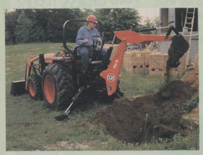
Bush Hog 762H accepts either regular or heavy-duty buckets in 9-, 13-, 16-, 24- and 36-in. widths. Maximum reach is 9'6".