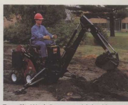
Toro SiteWork Systems with backhoe