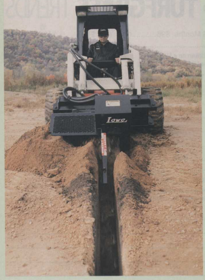
The Lowe Model 7 hydraulic trencher adds versatility to smaller skid steer loaders in the 800- to 1000-lb. class.