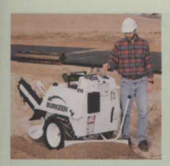
The Burkeen B-30 Combination Trencher/Vibratory Plow

pipe of various types up to 2 inches in diameter.