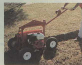
Elite offers four trenchers.

products, made in Cape Coral, FL, dig at depths ranging from 6 to 12 in. The push-forward disc blade type trencher can dig 20 to 30 ft. per minute. The 900-lb. winch design