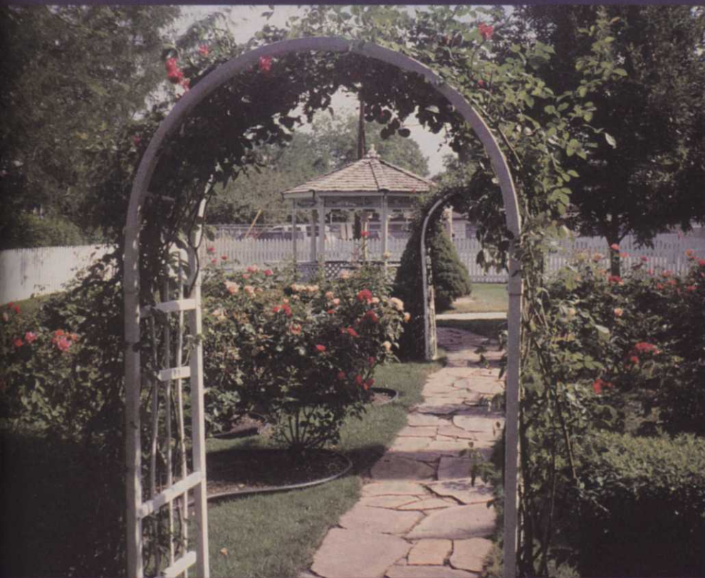
▲ A formal rose garden and gazebo near the historic Alexander House.