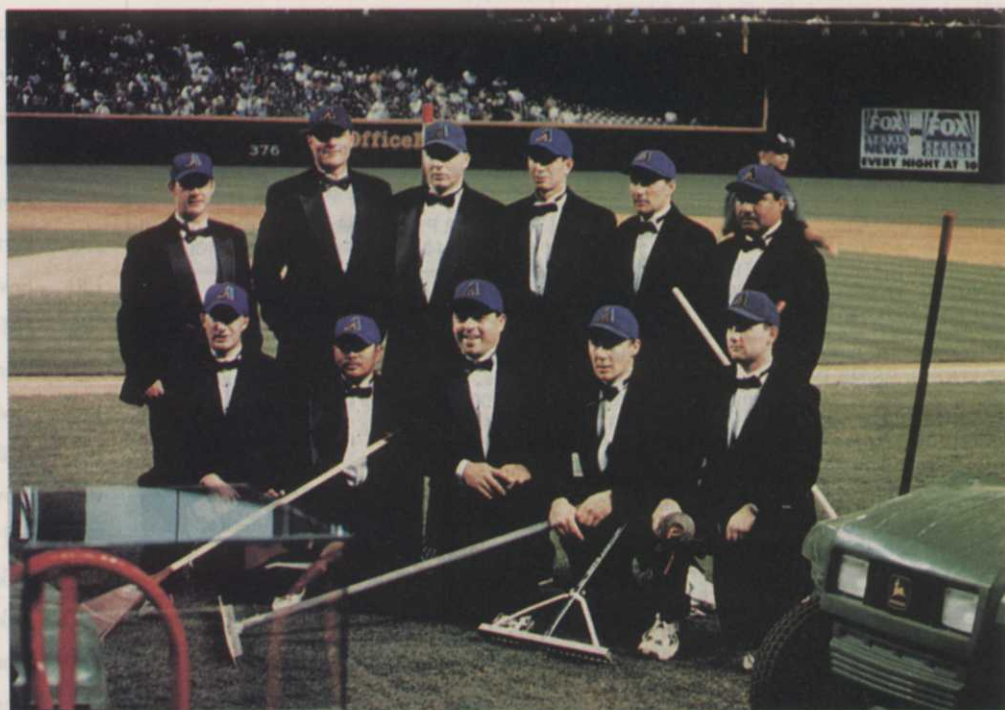
A black-tie affair? When the Arizona Diamondbacks opened the 1998 season, their first season in Bank One Ballpark, a domed stadium with a zoysiagrass playing field, the grounds crew showed up in tuxedos. Hey fellas, what about those sneakers?